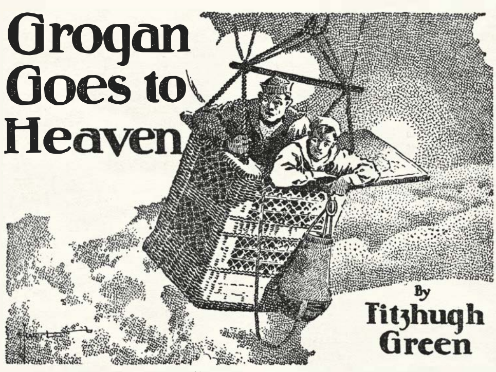
Author of "The Dynamite Drift," Etc.