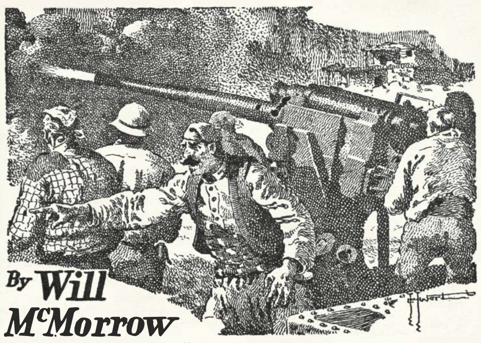
Author of "Look 'Em in the Eye," Etc.